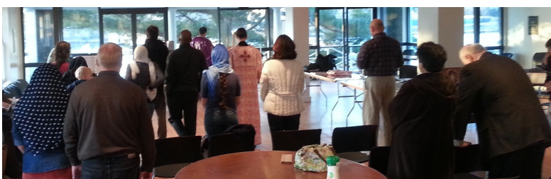
3: Presanctified Liturgy served during Lent at St. John's College.