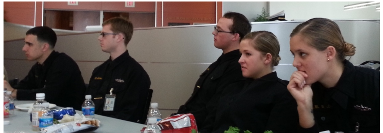
8: Some of the Orthodox mids who attend our services at the USNA.