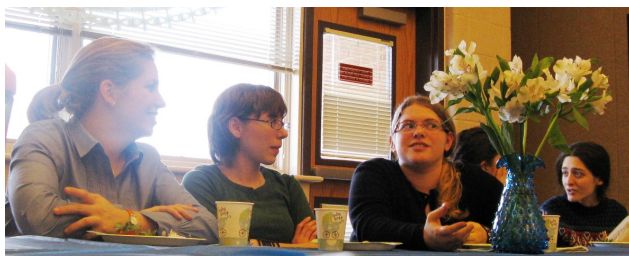
9: St. John's students socializing after Liturgy at Holy Archangels Mission.

(Please Note the Change of Address) 1353 Tydings Rd. Annapolis, MD 21409