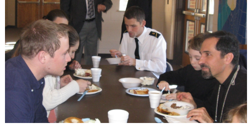
1 Mids fellowshiping at the Mission

We have so much to be thankful for: This ministry, started in 2004, has been blessed to keep going and growing. Holy Archangels Orthodox Mission has emerged out of the desire of the college students for local worship and a place to bring their friends and classmates seeking the truth of Christ. Weekly services and pastoral counseling and mentoring are offered students at St. John's College and the midshipmen at the U.S. Naval Academy and for the first time, we have engaged in outreach efforts at Anne Arundel Community College.